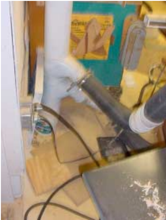
Figure 6: Is looking down toward the floor on the left side. The bottom of the vertical duct you see on fig. 4. The blue on the bottom (just under the cords) is the very bottom of the duct. The blue is a plastic whipped cream lid I use to cover the end, which is used for a clean out. Further up is the blast gate, which goes to my planner. I'm leaning over it to take the picture. Just below it is the gate that goes to the table saw. See Figure 7.