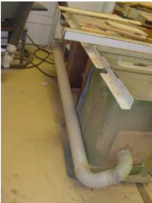
Figure 7: Goes out to the end of the table saw. You see 4" PVC here, going back toward the main branch.