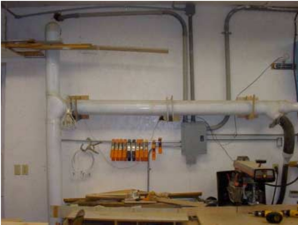
Figure 4: Is directly on the opposite side of the wall from the collector. On the left is the 6" galvanized running from the floor to the ceiling. Across the center is the branch. The gray box in the center is a secondary power panel.