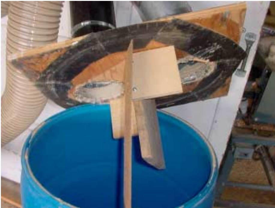
Figure 2: The secondary collector. It is a surplus 55 gal plastic barrel. The top of the collector is opened showing the baffles. The dust flows in on the left and out on the right.