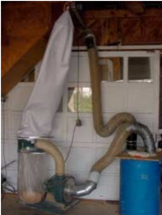
Figure 1: Shows the collector with bags installed and the secondary collector the blue barrel on the right). The shop is on the opposite side of the wall from the first several figures.

Indeed, the flow is so good that the secondary collector is being bypassed and the lower bag is being filled too fast. So it's back to the drawing board and redo the baffles, or plan on installing one of those centrifugal collectors.