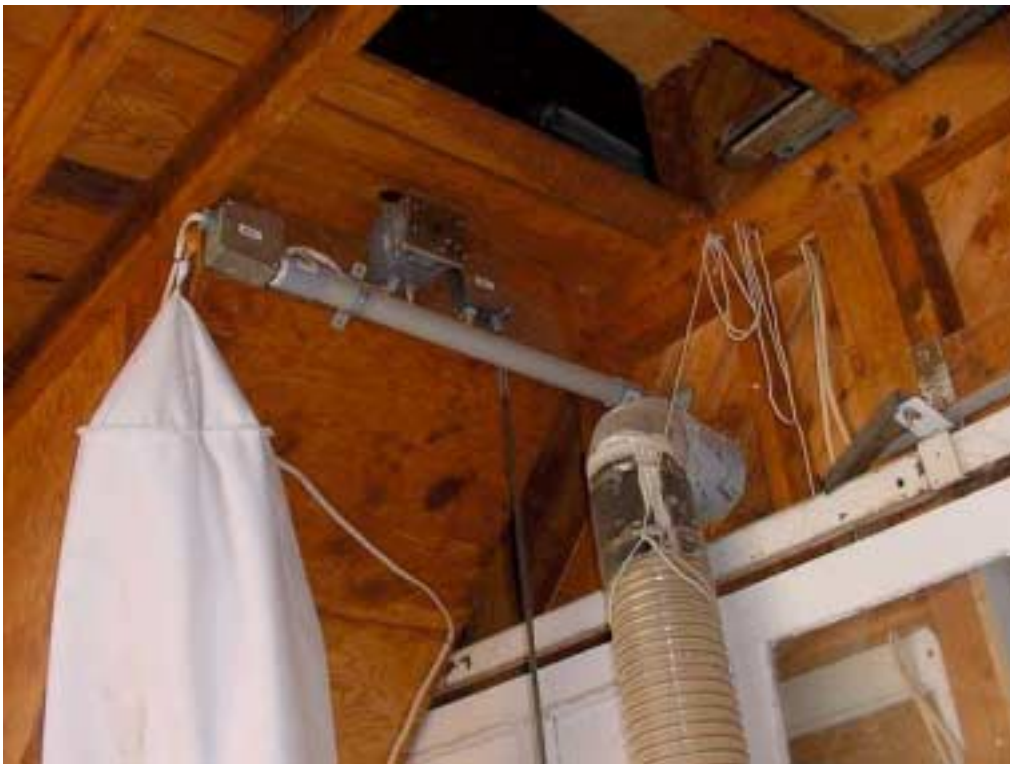
Figure 3: Looking up at the ceiling. The new bag is attached on the left. The air comes on the right via 6" galvanized and is coupled to 6" flex. The gray tube is electrical conduit, with the drop coming down. The box in the center houses the power relay, which is controlled from the shop.