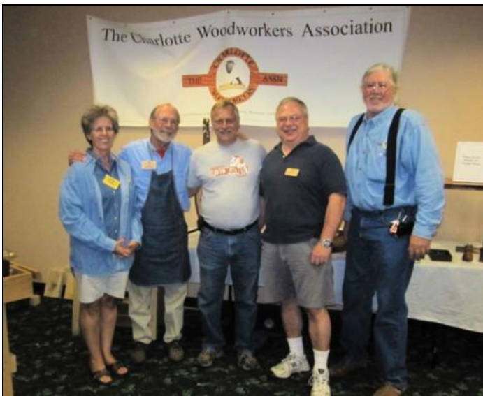
See Page 7 for Other Pictures from Mathews Alive